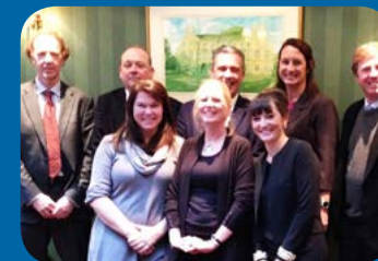
Above: The first C-FISH Fund Board Meeting was held in London, 2014. Board representatives include The CARIBSAVE Partnership, Virgin Holidays, The Travel Foundation, The Sandals Foundation & Royal Caribbean Cruises.

The Fund will compliment & support other national & regional funds (e.g. the Regional Biodiversity Fund) that support marine conservation & coastal livelihoods in the Caribbean. The Board of the C-FISH Fund welcomes the participation of other businesses with an interest in supporting the Caribbean.