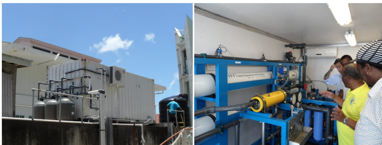
Figure 3: Exterior and interior view of the containerized SWRO plant installed in Bequia

The water distribution system includes a permeate tank of 16,000 liters capacity, installed immediately after the desalination plant, plus a water storage and distribution tank of 90,000 liters capacity 1 .