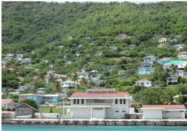
Figure 1: Paget Farm community in Bequia, with Fisheries Complex in the foreground

Of particular concern is the Paget Farms community (Figure 1) where the least wealthy population of the island lives. The entire community relies exclusively on rain water harvesting as the source of potable domestic water. In fact, many of the households in the Paget Farms community, the population targeted by this pilot, are equipped with underground storage that fill during the rainy season. The others utilize one or more glass reinforced plastic tanks that do not