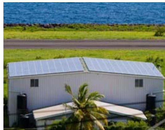
Figure 2: Hangar at Bequia Airport with solar panels installed on the roof

A renewable energy (photovoltaic) system was installed on the roof of the hangar at the Bequia Airport and connected to the national VINLEC grid, and is monitored via an installed meter. A power purchase agreement will be reached with VINLEC